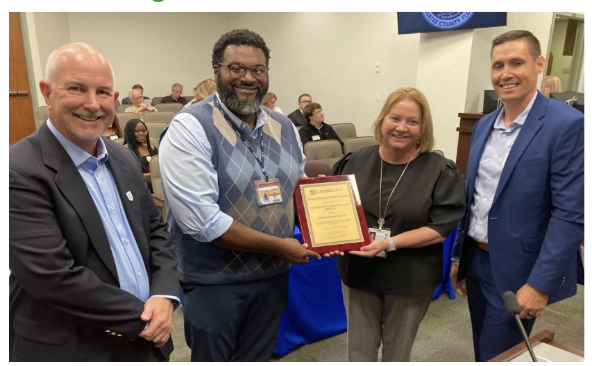
Earning 'District of the Year' Status