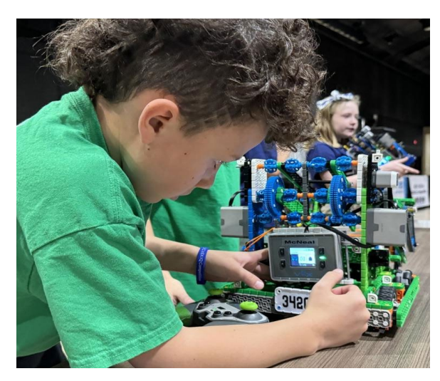
Adding Options for Science Technology Engineering and Math