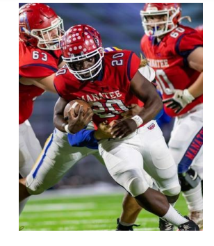
Enhancing Arts and Athletics