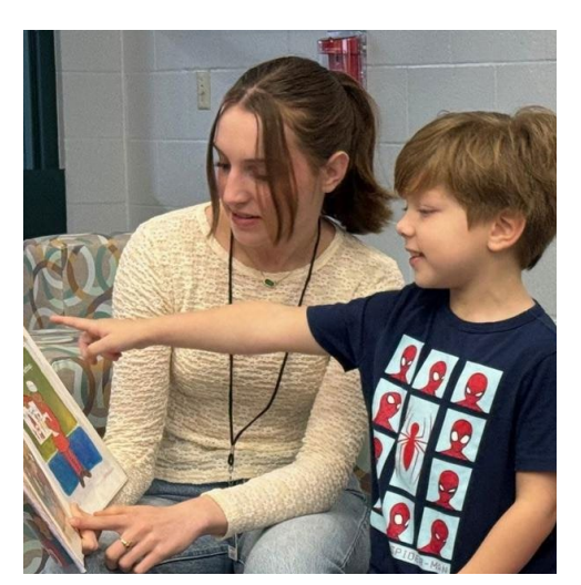
Expanding Early Literacy Programs